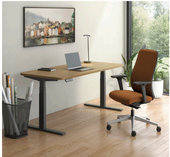
Radius Corners option