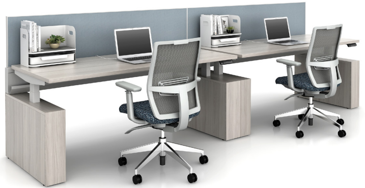
PowerBench one-sided application.

PowerBench optimizes space while fostering collaboration among employees thanks to its simple and succinct kit of parts. Whether teams are working side-by-side or individuals are focused on the tasks of the day, the efficient footprint of PowerBench provides all the essentials needed today. Place Day-to-Day tables nearby for swift collaboration, Calibrate lockers for personal storage, and Chatham Cove Work Lounge for private, heads-down work. Our broad product offering provides many choices to support the varied needs of users today.