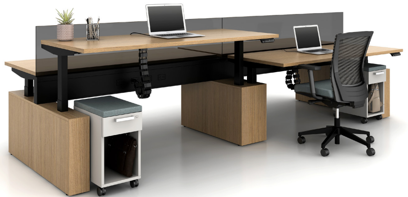
PowerBench two-sided application highlighting powered spine.