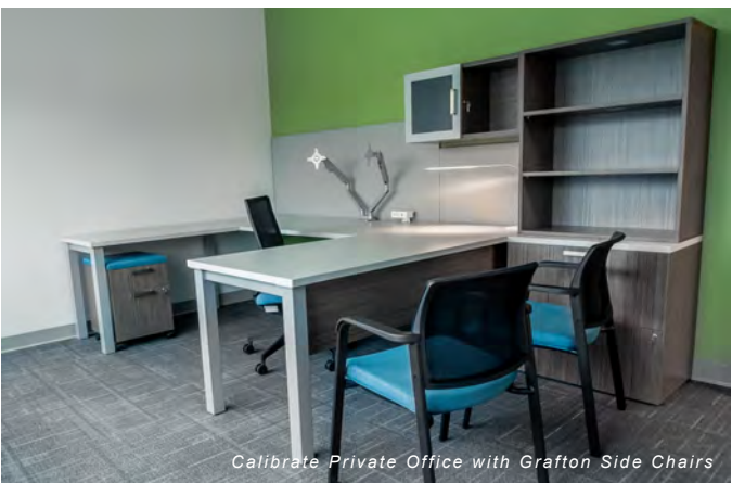
Calibrate Private Office with Grafton Side Chairs