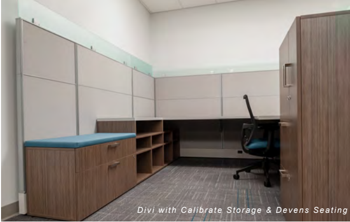
Divi with Calibrate Storage & Devens Seating