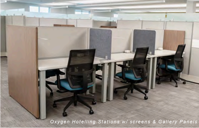
Oxygen Hotelling Stations w/ screens & Gallery Panels