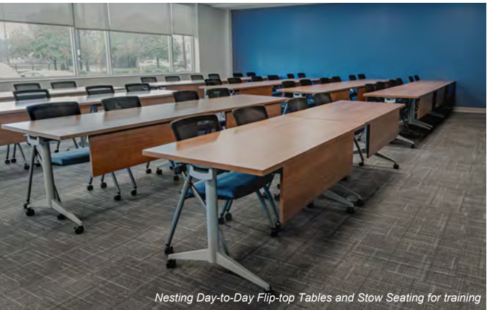
Nesting Day-to-Day Flip-top Tables and Stow Seating for training