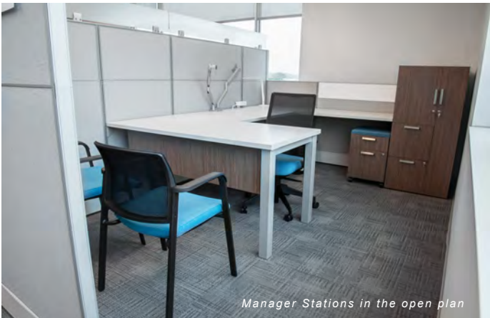
Manager Stations in the open plan