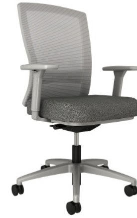
Task with lumbar

Designed for focused tasks or working on the go, Natick offers the perfect amount of sophistication and comfort. Natick makes a stylish statement while supporting users throughout the day. It's easy to fine-tune this highly adaptable chair to meet individual needs.