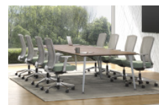
Worksurface: Aimtoo Savatre Natick Seating: Terrain | Peacock Soft Ottoman: Terrain | Heron