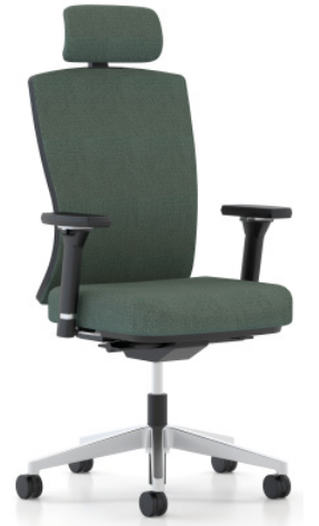
Executive (with headrest)