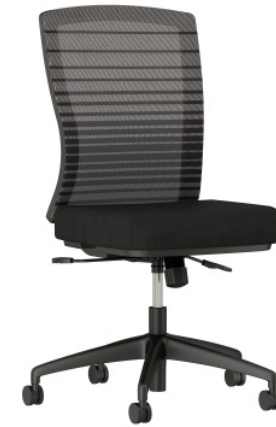
Armless with Center Tension Syncho-Tilt