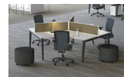
Oxygen Worksurface + Tables: True White Screens: Nature | Firefly Legs: Black Natick Seating: Fedora | Midnight

Please request samples to view before specifying as the colors, materials and finishes featured within our printed and electronic literature may vary due to the printing processes and/or viewing screens used. Availability of finishes and materials shown within this brochure may vary due to manufacturers' lifecycle management.