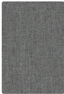
Pebble Beach Storm 165-006