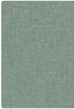
Pebble Beach Aloe 165-013