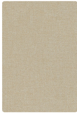
Pebble Beach Linen 165-002