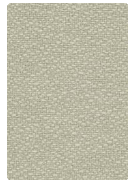
Basic Patina 162-003