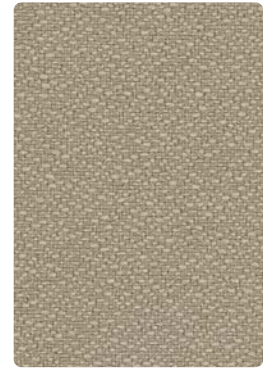
Basic Earth 162-010