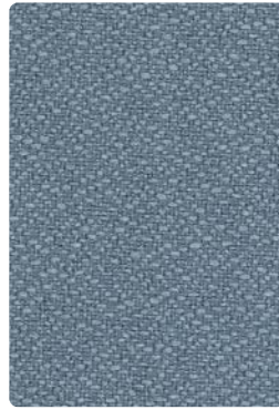
Basic Denim 162-004