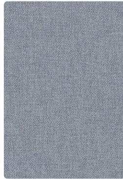
Pebble Beach Blue Mist 165-004