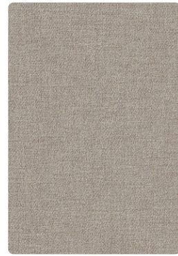
Pebble Beach Parchment 165-007