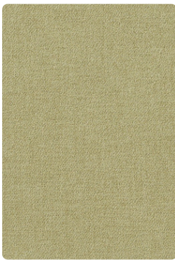
Pebble Beach Spring 165-003