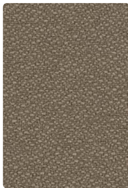
Basic Pumice 162-000