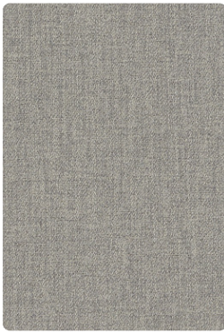
Pebble Beach Grey Mix 165-016