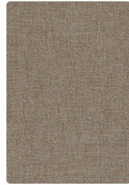
Pebble Beach Earth 165-000