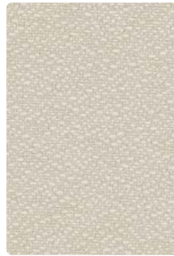
Basic Parchment 162-007