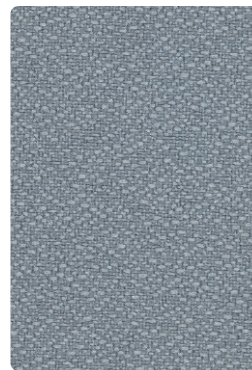
Basic Shadow 162-016