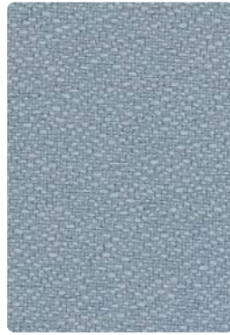
Basic Blue Mist 162-014