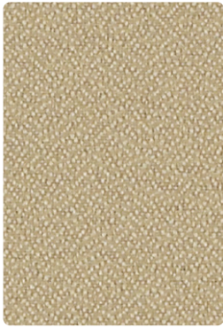
Basic Caramel 162-002