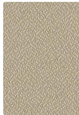
Basic Sand 162-017