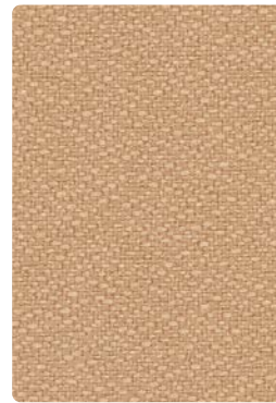
Basic Mesa 162-009