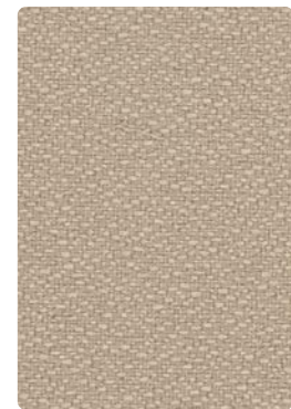
Basic Taupe 162-027