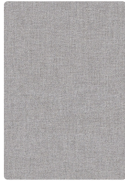
Pebble Beach Aluminum 165-026