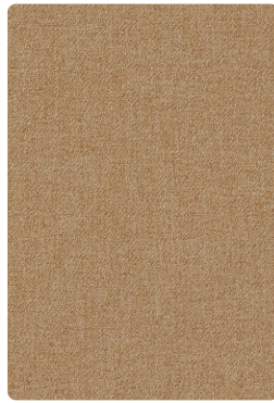
Pebble Beach Mesa 165-009