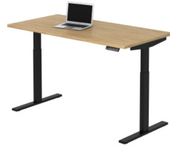
Shown with black leg finish.