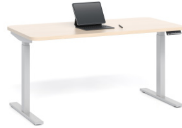
Shown with white leg finish.