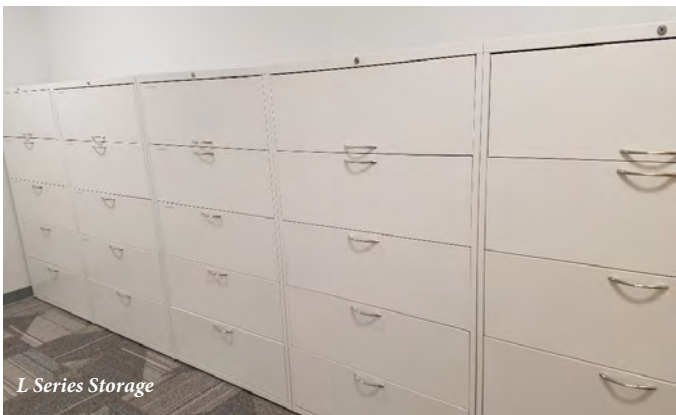
L Series Storage