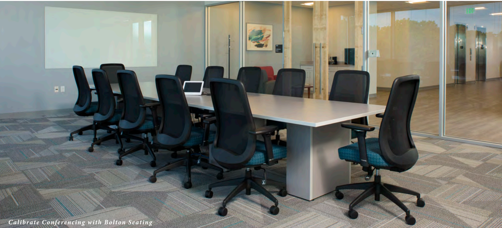
Calibrate Conferencing with Bolton Seating