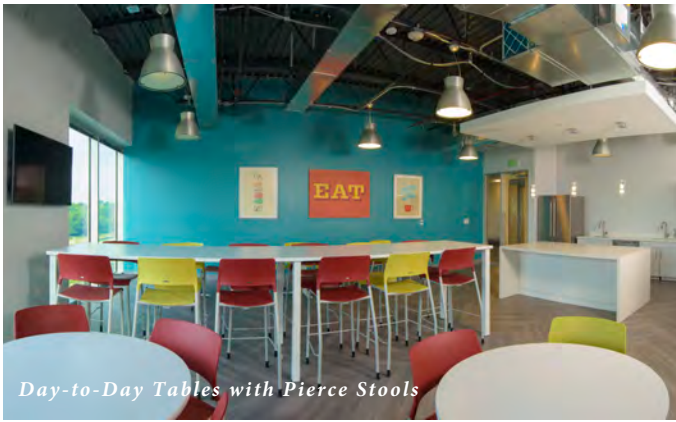
Day-to-Day Tables with Pierce Stools