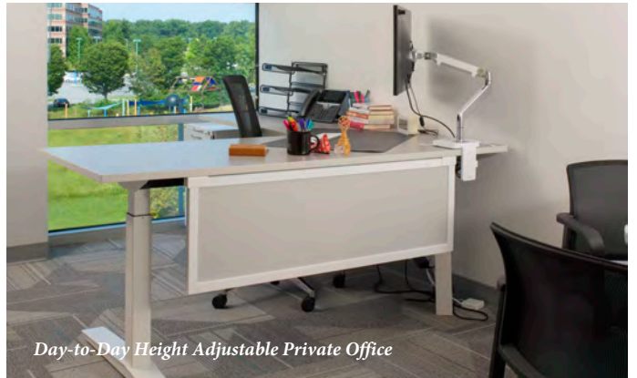
Day-to-Day Height Adjustable Private Office