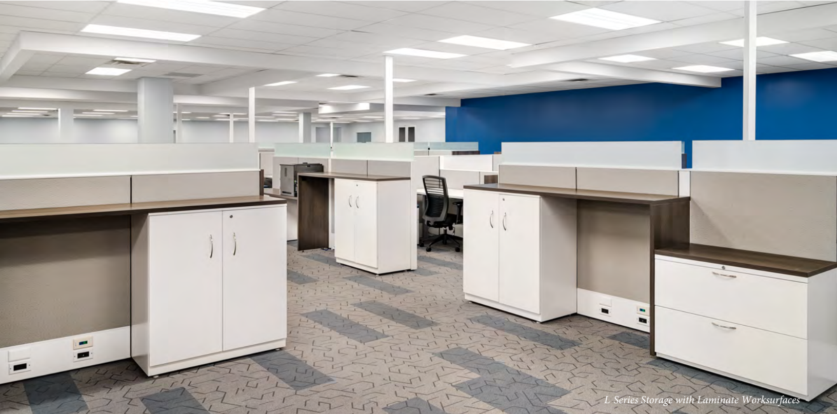
L Series Storage with Laminate Worksurfaces