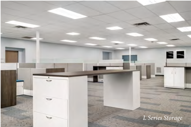
L Series Storage