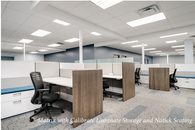
Matrix with Calibrate Laminate Storage and Natick Seating

For additional images: http://imagelibrary.ais-inc.com/