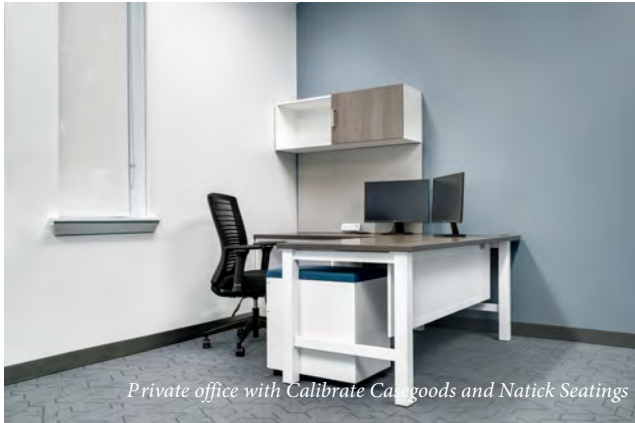
Private office with Calibrate Casework and Natick Seatings